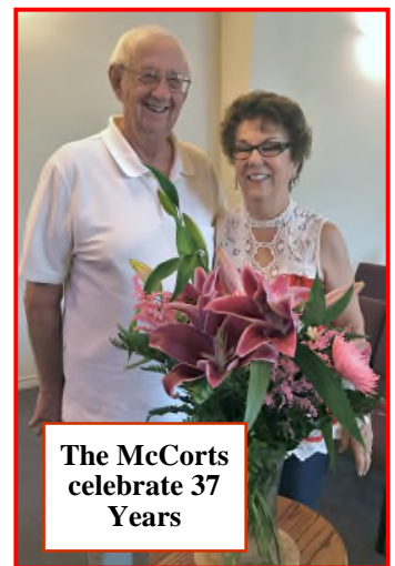
The McCorts celebrate 37 Years