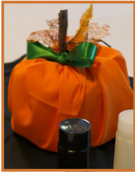
A Shirley Pumpkin and a real Pumpkin Cake